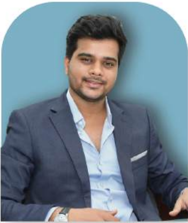
CHAIRMAN AND MANAGING DIRECTOR